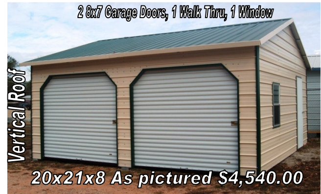
2 8x7 Garage Doors, 1 Walk Thru, 1 Window