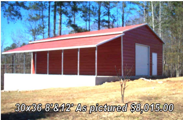
30x36 8' & 12' As pictured $8,015.00