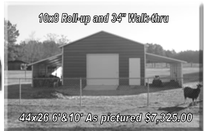
10x8 Roll-up and 34" Walk-thru