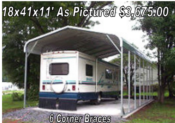
6 Corner Braces