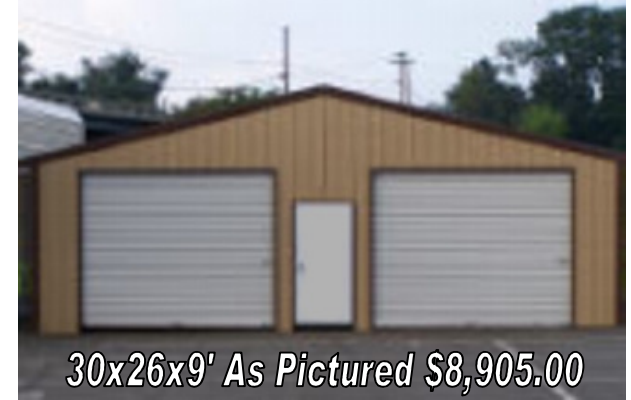
30x26x9' As Pictured $8,905.00