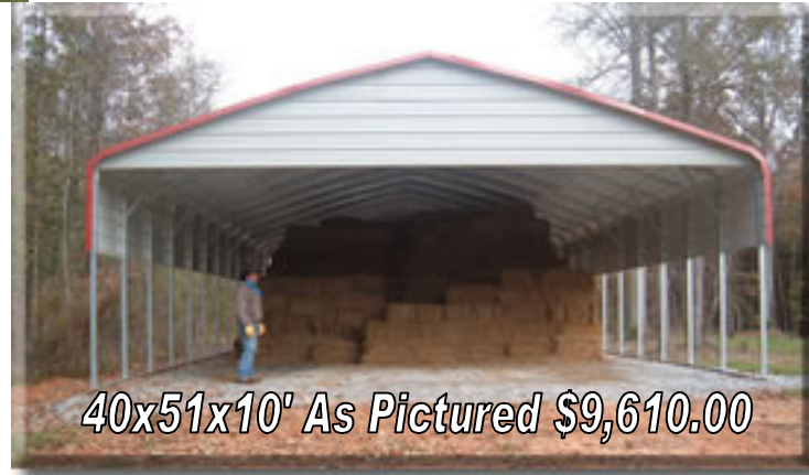
40x51x10' As Pictured $9,610.00